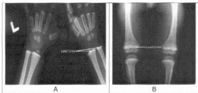
Fig. 1: X-ray images showing lead in bones of one of the lead poisoned children (Mo4).

linear increase in the density of the metaphyses, attributed to the significant lead uptake that had already occurred in the bones.